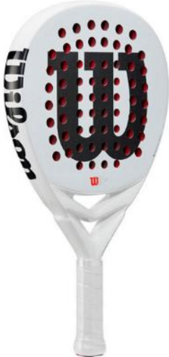
BELA V2.5 LT WR161411U+