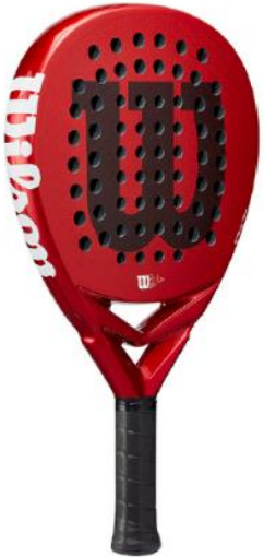
BELA V2.5 ELITE WR161311U+