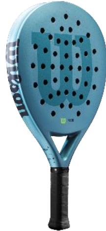
ACCENT V1 LT