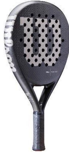
CARBON FORCE LT