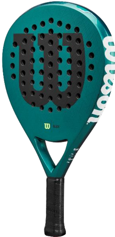
BLADE v3 HYBRID FACE FIRM FOAM