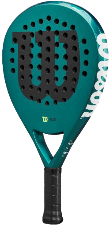
BLADE v3 PRO CARBON FIBER FACE FIRM FOAM