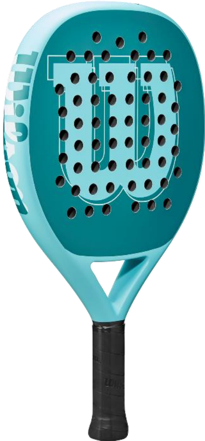
PACE v1 BLUE