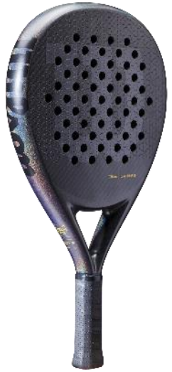
CARBON FORCE PRO