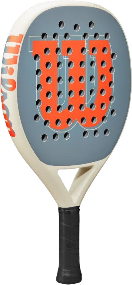
PACE v1 RED