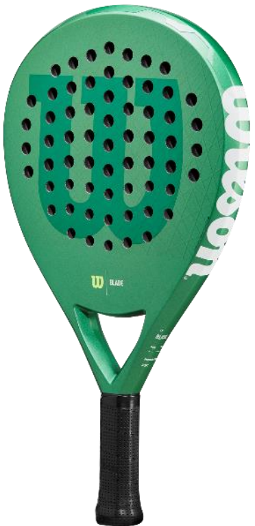
BLADE v3 LS FIBERGLASS FACE SOFT FOAM