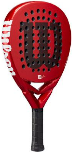
BELA V2.5 PRO WR161511F+